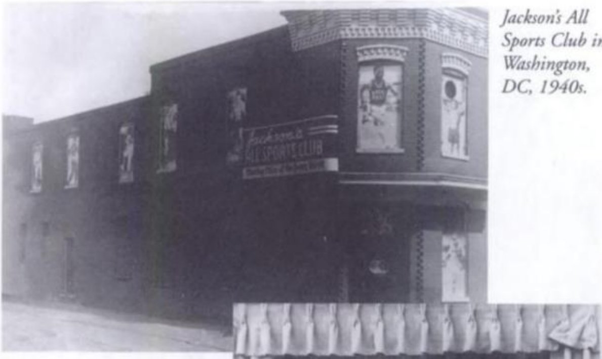
Jackson's All Sports Club in Washington, DC, 1940s.