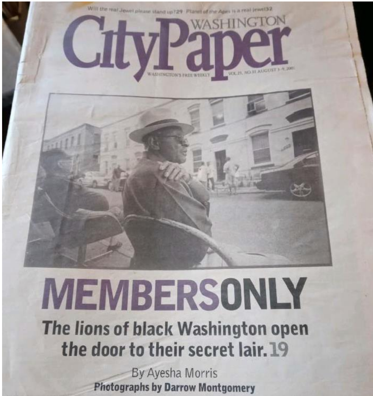
Figure 5: Cover story on the Wiltberger Club House in the August 3-9, 2001 issue of Washington City Paper.