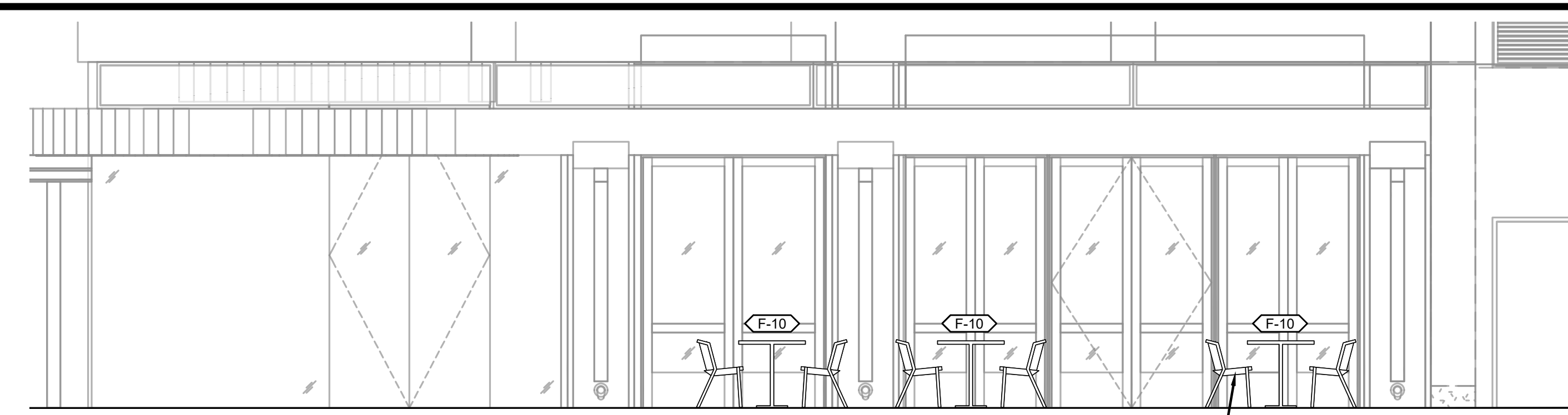
3 PROPOSED PATIO ELEVATION FIRST STREET SCALE: 1/4"=1'-0"