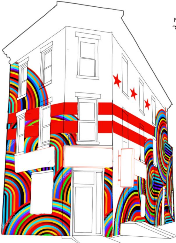
Mural concept #2 "Stars and stripes"