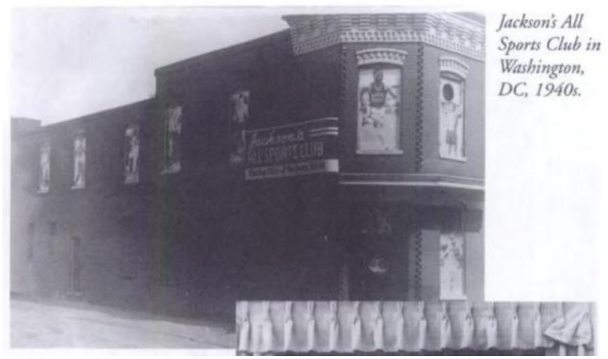
Figure 3: Photograph of Jackson's All Sports Club From Jackson, Harold. 2001. <u>The House that Jack Built: The Autobiography of a Successful</u> <u>American Dreamer Businessman and Entertainer</u>. P.54. 2001. P.54