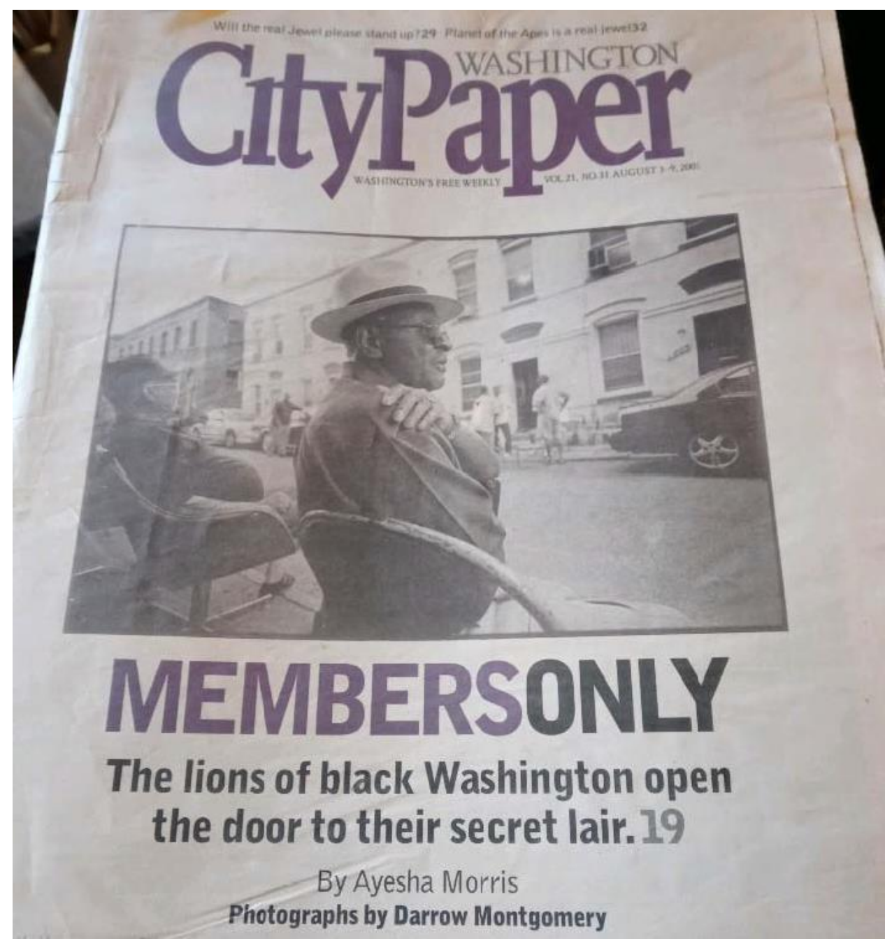
Figure 5: Cover story on the Wiltberger Club House in the August 3-9, 2001 issue of Washington City Paper.