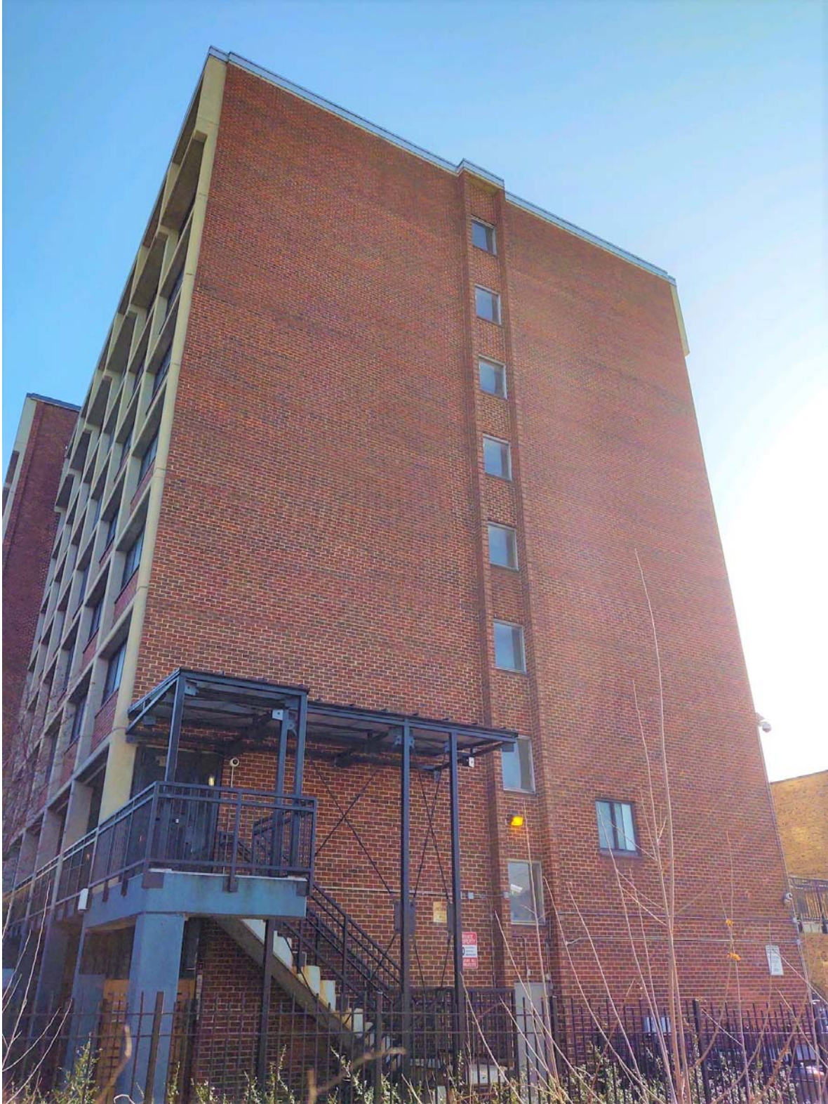
Lincoln Westmoreland Apartments, 1730 7 th Street, NW, North Wall